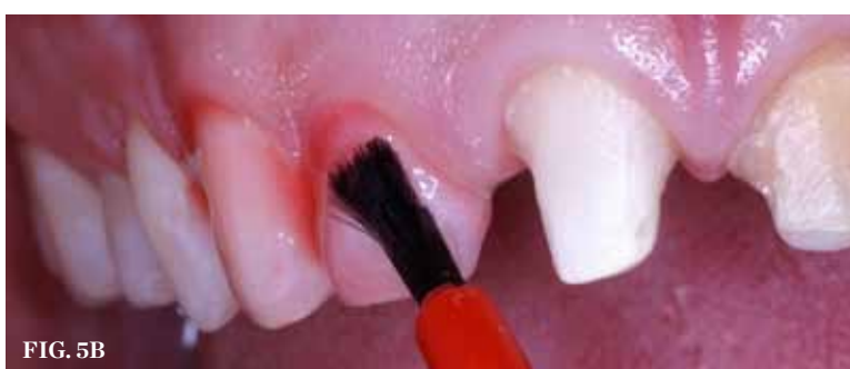
(3.) Restorations returned from the laboratory. Note the difference in the appearance of the porcelain of the crown and veneers due to porcelain thickness. (A) facial view; (B) lingual view. (4.) Lingual block-out of enamel surfaces with a gingival barrier resin. (5.) Etching intra-enamel veneer preparations for 15 to 30 seconds. (A) initial application of phosphoric acid etchant; (B) using a brush to paint phosphoric-acid etchant over the enamel surfaces to be bonded and restored.

the facial surfaces. A digital photograph of the preparations was included to show the ceramist the endodontic staining of tooth No. 9, and the diagnostic wax-up was included with the impressions as well. Because of the optical property differences between a thicker crown and thin veneer, a 35% opacity for the porcelain was requested for the veneers and crowns. Provisional crowns were fabricated for teeth Nos. 8 and 9 using a prefabricated acrylic resin shell that was relined and adjusted chairside. Teeth Nos. 6, 7, 10, and 11 did not require provisional restorations because they were minimally reshaped.